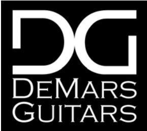
EQUINOX R to be launched 2010